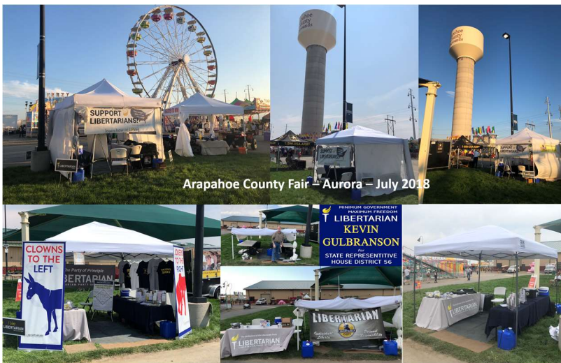
Arapahoe County Fair – Aurora – July 2018