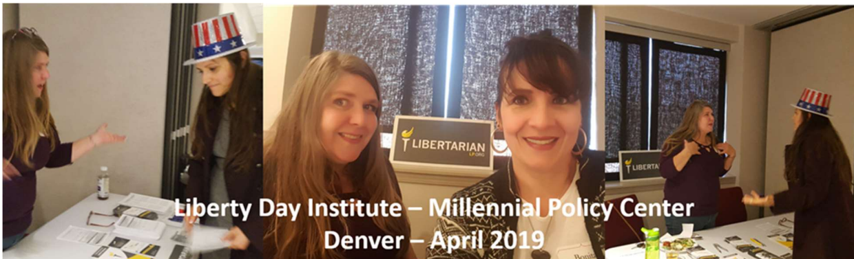
Liberty Day Institute – Millennial Policy Center Denver – April 2019