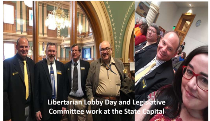
Libertarian Lobby Day and Legislative Committee work at the State Capital

I intend to participate in as many future Outreach events as possible and will bring Doritos!!